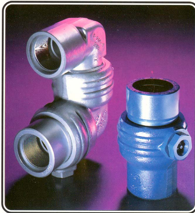
HIGH PRESSURE SWIVEL JOINTS AND HOSE LOOPS 3/4" – 4" Sizes in eight different styles - 1,000 psi to 6,000 psi.